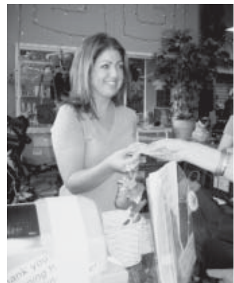
Top and Center: Vintage Values on College Road.