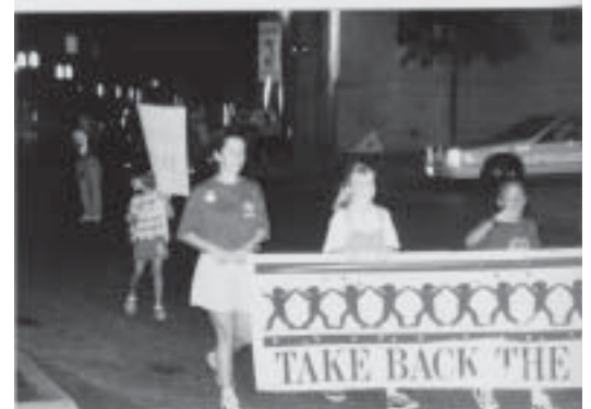
Previous Take Back The Night Rally